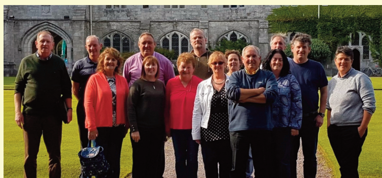
KSF and Skellig CRI/UCC have developed a Certificate in Practice Support in Social Farming Course –Level 6. Here are some Kerry farmers who completed the course in 2019. Please contact us if you would like more information on this course.

We are seeking support from our local farmers throughout Kerry to engage with us and offer opportunities for our participants on your farms. This will ensure the projects continued growth and success.